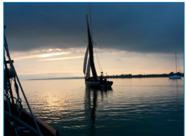
Bona ghosting up the Stour