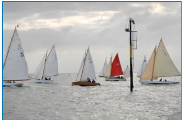
Maldon Regatta: start off Nass beacon (Mervyn Maggs)