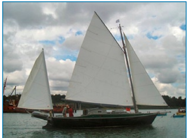
Crow on the Orwell