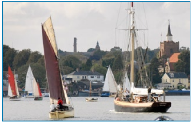
Maldon Regatta: finish of the Parade of Sail