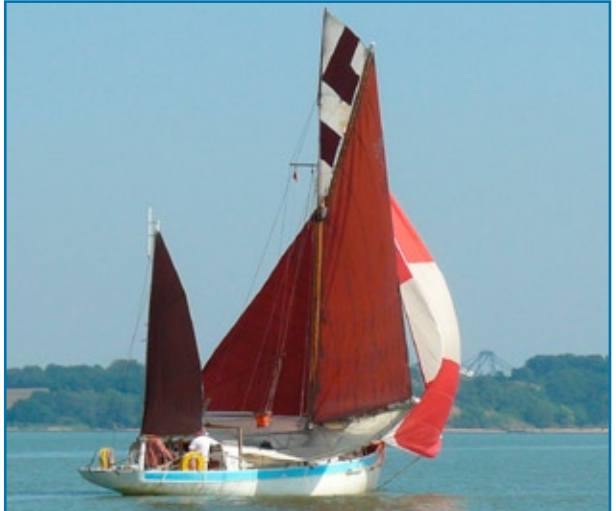
Gwenili with everything flying