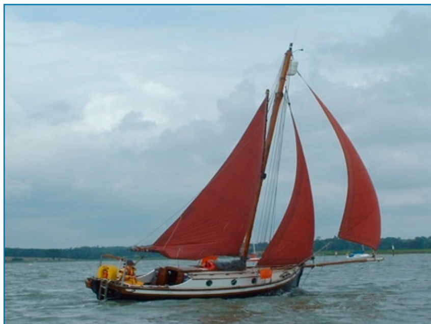
Plum on the River Stour